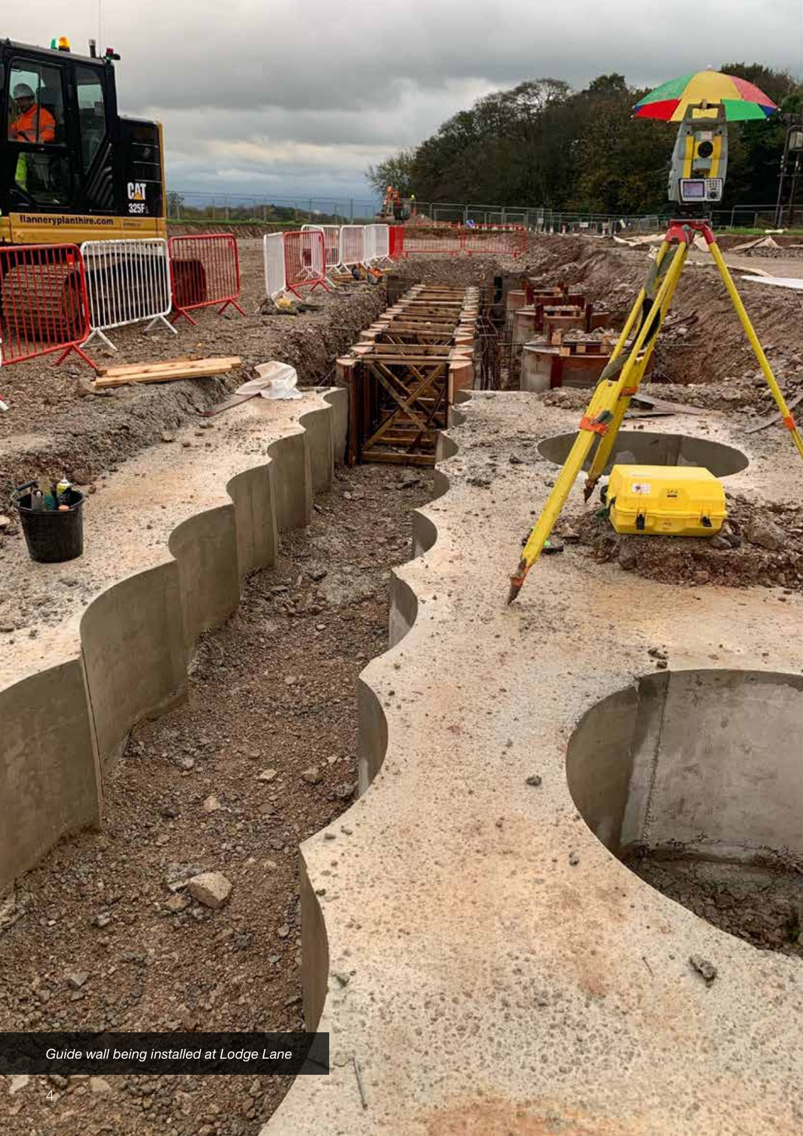
Guide wall being installed at Lodge Lane